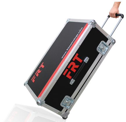
safe transport in a roller case